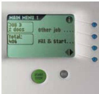
Central control panel with user-friendly interface.

For occasional applications or novice users, the "Fill and Start" feature allows you to simply load your documents and envelopes and run the job. The M3000 automatically calculates the size of the documents and sets the correct fold. Operation for the whole system is monitored from a single